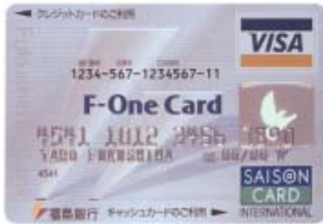
Saison F-One Card

With over 2,189 billion yen in sales volume and 11.4 million cardholders as of March 2001, Credit Saison is one of the leading credit card companies in Japan. The Company has achieved high growth by expanding its credit card, leasing, insurance, and T&E (travel and entertainment) businesses, while developing new business channels which respond swiftly to changes in consumer needs.